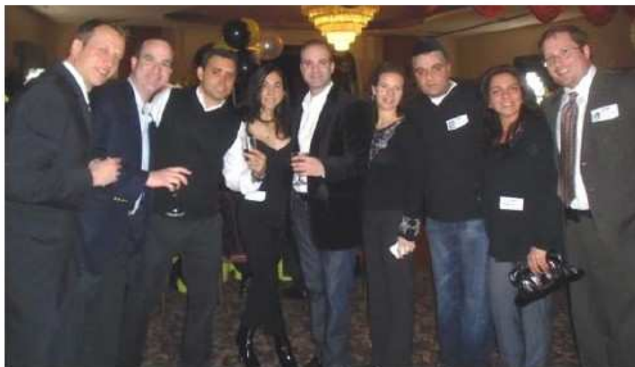
1987 classmates reunited