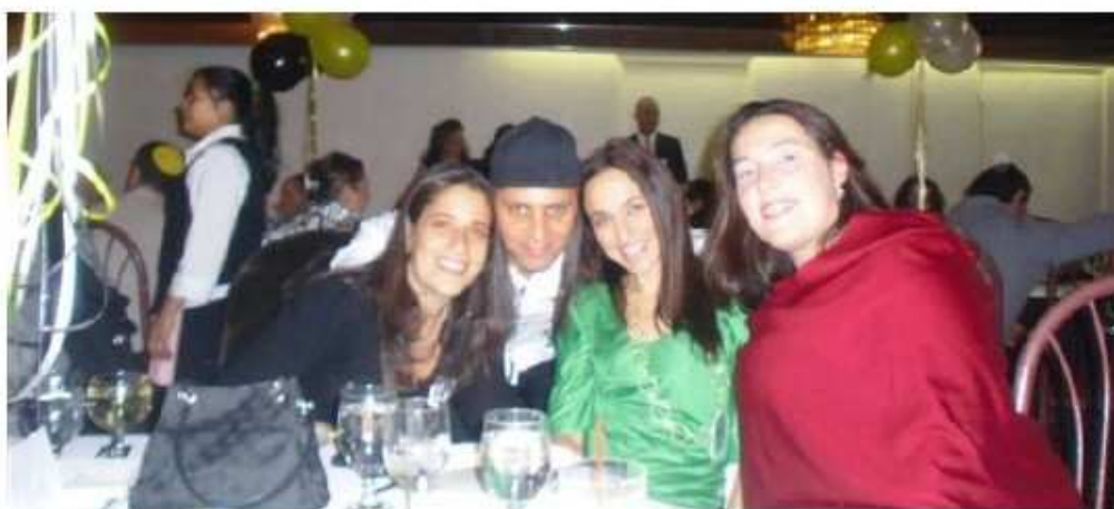
Sharing a smile for the camera